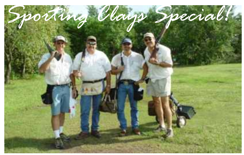
Sporting Clays (continued from page 1)

Panduit Corporation, Powell Electrical Mfg., Phoenix Contact, Priority Wire & Cable, Reily/Wesco, Rexel/Summers, Siemens, Square D Company, Truluck's Restaurant, Unity Mfg., Warren Electric Group, Wholesale Electric Supply, and Wildcat Electric Company.