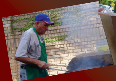
▲ ◀ Kilowatt Kooker Team at work