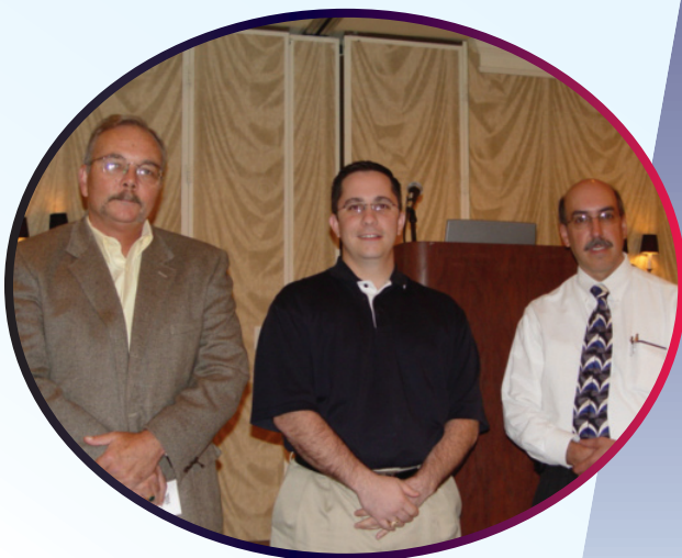
New Board Members