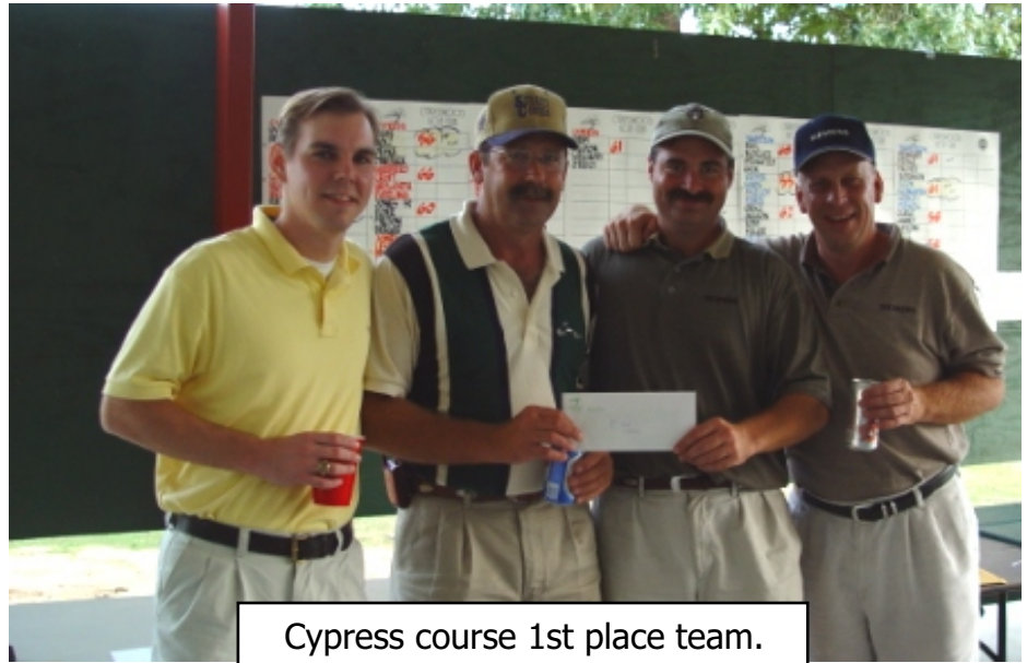
Cypress course 1st place team.